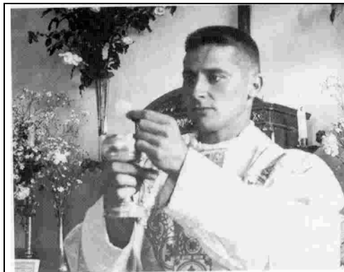
Prima messa 8 dicembre 1954